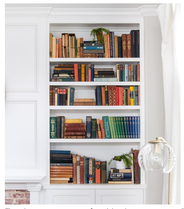
They bring a worn, comfortable character as well as a formality that we often don't find in modern pieces. The perfect combination for that casually elegant look.